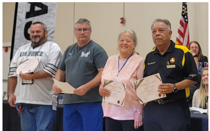
Moose of the Year